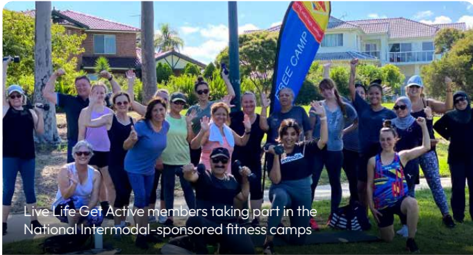
Live Life Get Active members taking part in the National Intermodal-sponsored fitness camps