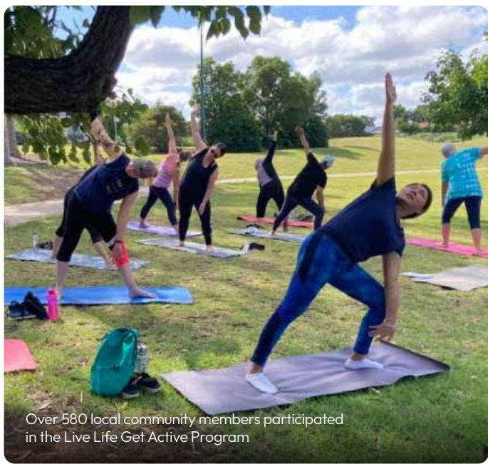
Over 580 local community members participated in the Live Life Get Active Program