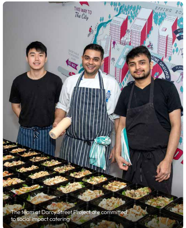
The team at Darcy Street Project are committed to social impact catering

National Intermodal is proud to have supported Darcy Street Project as it continues to engage youth in positive food experiences and brings meaningful employment and training to affected youth within the Moorebank community.